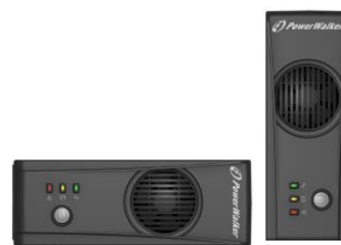
2-in1 Rack/Tower design