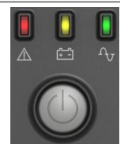
LED Display, On/Off button